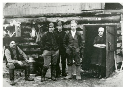
Common sauna, laundry room and bakery

Every railway construction required many workers and horses to transport sand, make railway sleepers (picture) and carve bridge stones. Some wives earned money by selling food or coffee to the workers.