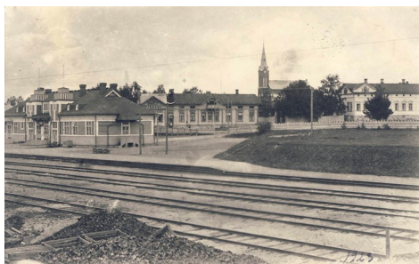
The railway station built in 1910